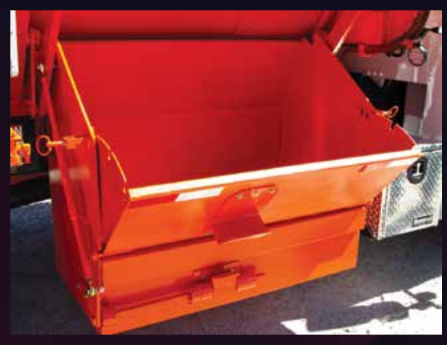
Optional Expandable Loading Hopper