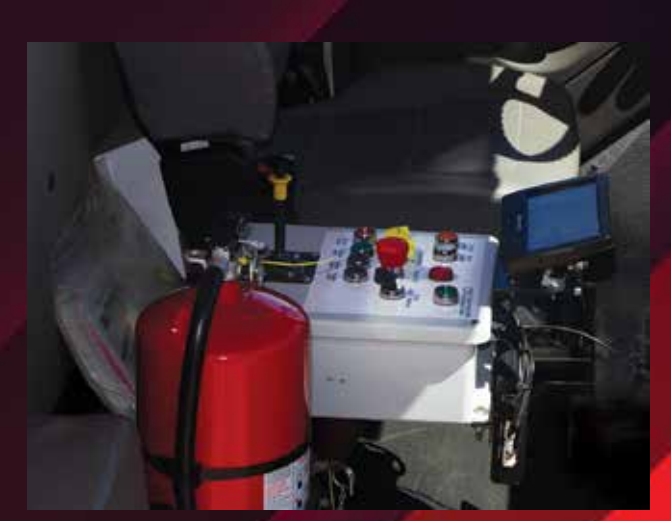
Ergonomically Designed Controls For Comfort and Efficient Operation